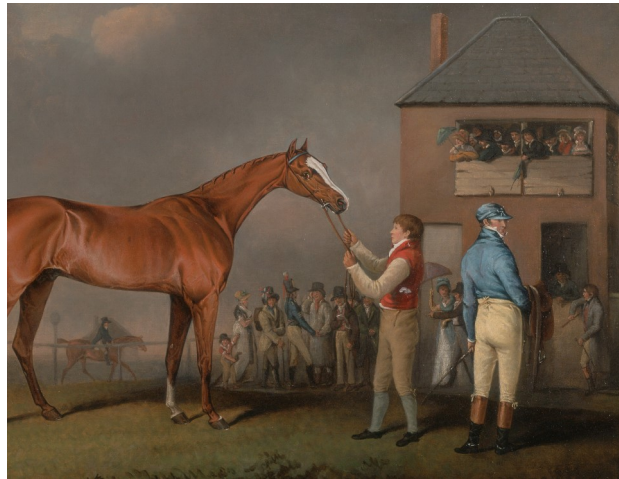
'Quiz, After His Last Race at Newmarket' by Henry Bernard Chalon, 1807.