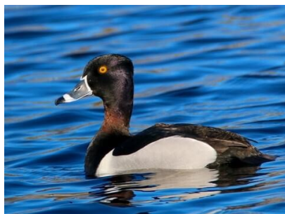
Ring Necked Duck